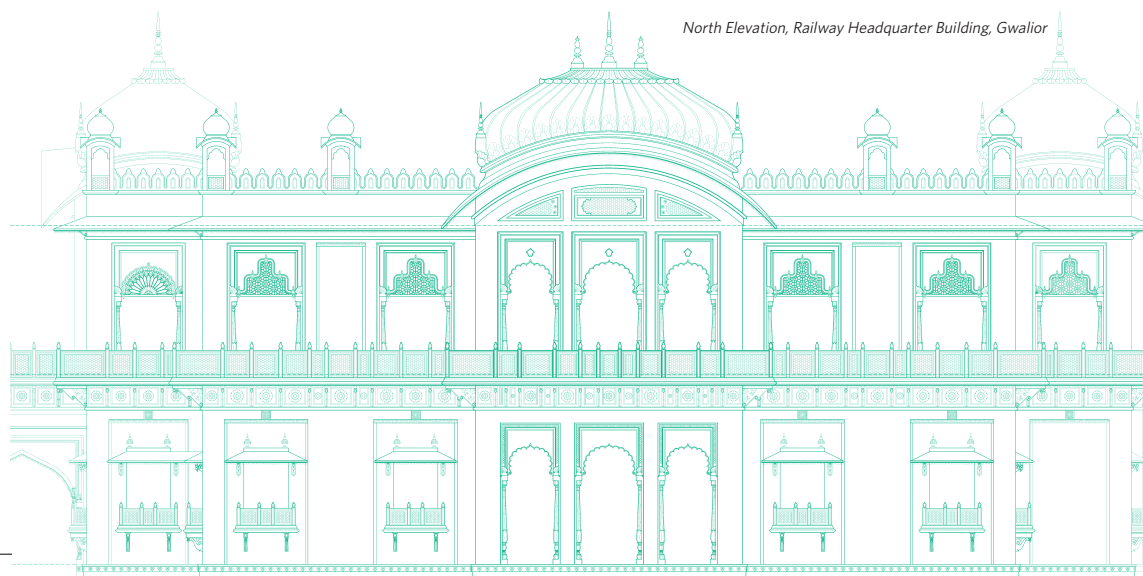
North Elevation, Railway Headquarter Building, Gwalior

disseminate this knowledge and documentation material by way of publications, events, exhibitions and workshops.