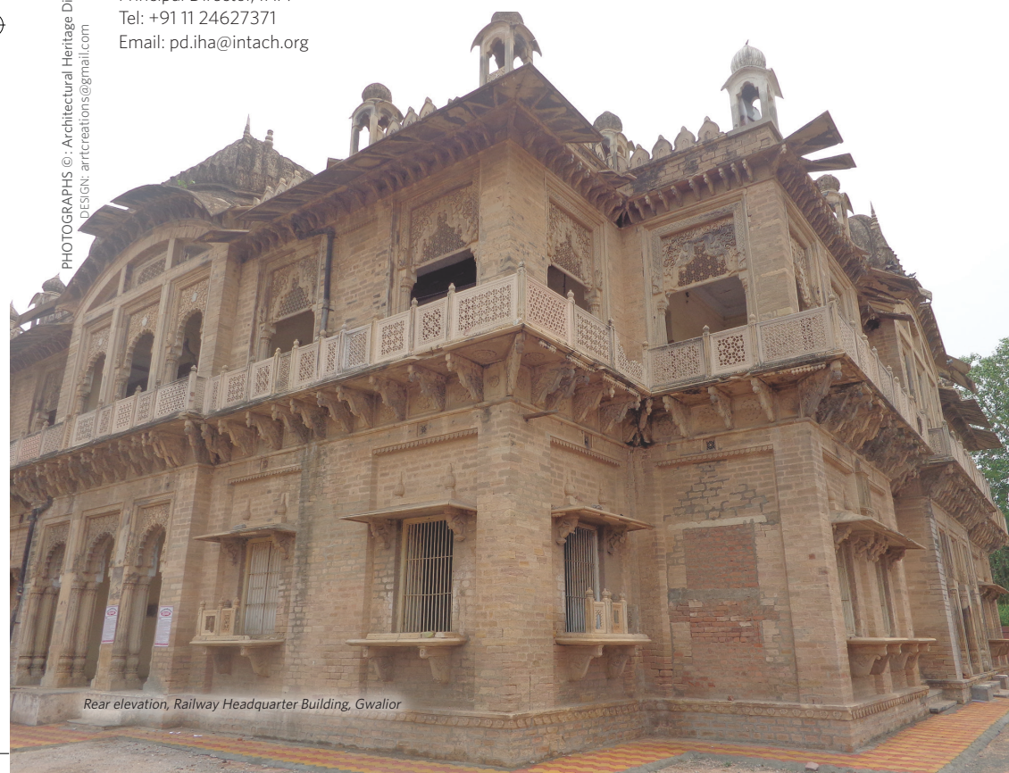
Rear elevation, Railway Headquarter Building, Gwalior

Indian National Trust for Art and Cultural Heritage (INTACH) offers a first-of-its-kind awards programme in the field cultural heritage conservation. The awards programme is titled - 'Heritage Awards for Excellence in Documentation', and will be offered at a national level.