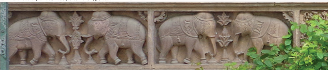
Front Porch, Railway Headquarter Building, Gwalior